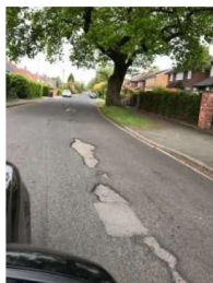
Fig 1 – Kings Road

Kings Road is already in need of repair, there are a number of significant holes and damaged worn tarmac (see Fig 1 below) from the current flow of traffic; this will be greatly affected by increased vehicle access especially heavy vehicles to the site and potentially is a greater risk for the many cyclists and walkers in the area. I think there could be an increased risk of accidents as there will be much more activity on Kings Road.